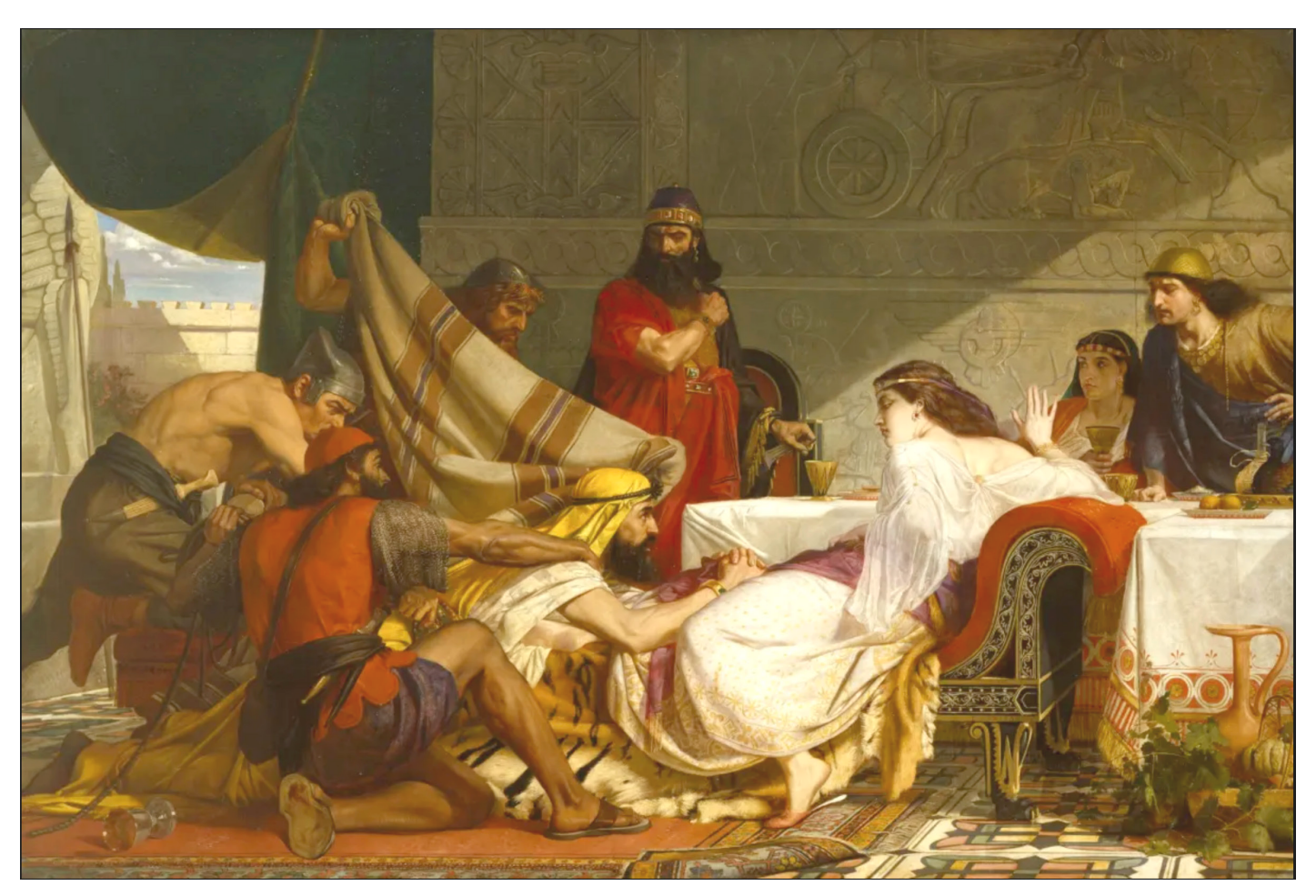
The Festival of Esther, 1865. Edward Armitage RA. Oil on canvas. 1200 mm x 1830 mm.