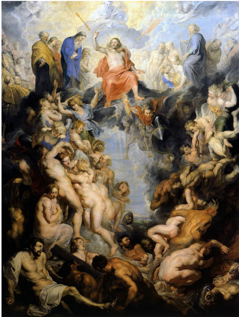
Last Judgment. Painting by Peter Paul Rubens from Art in the Christian Tradition , a project of the Vanderbilt Divinity Library, Nashville, TN.