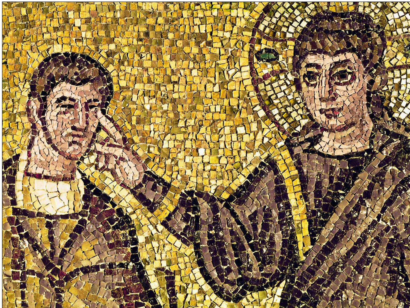
Jesus and Bartimaeus; mosaic, Church of San Appolinare Nuovo, Ravenna, Italy.