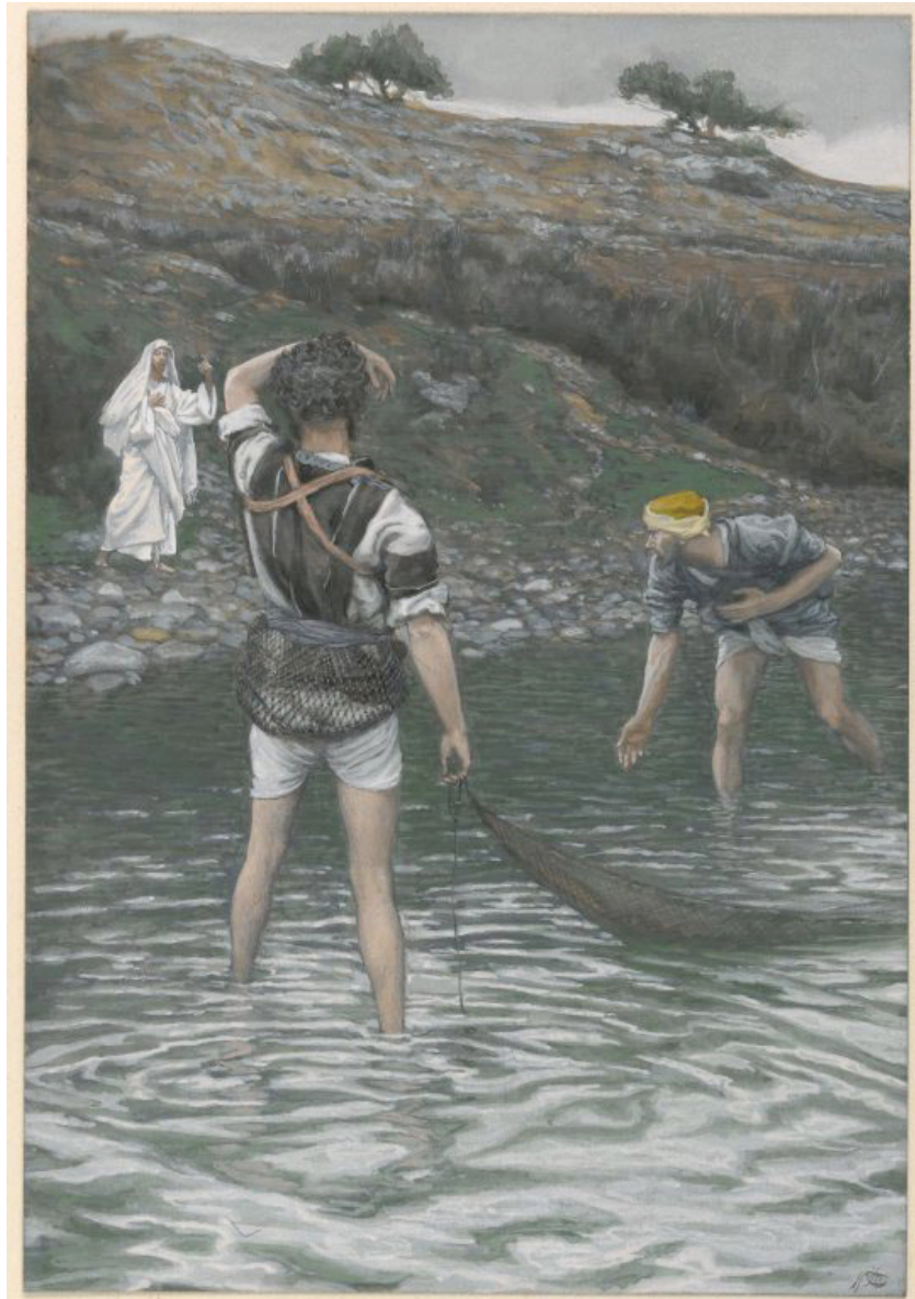
The calling of Peter and Andrew by James Tissot.