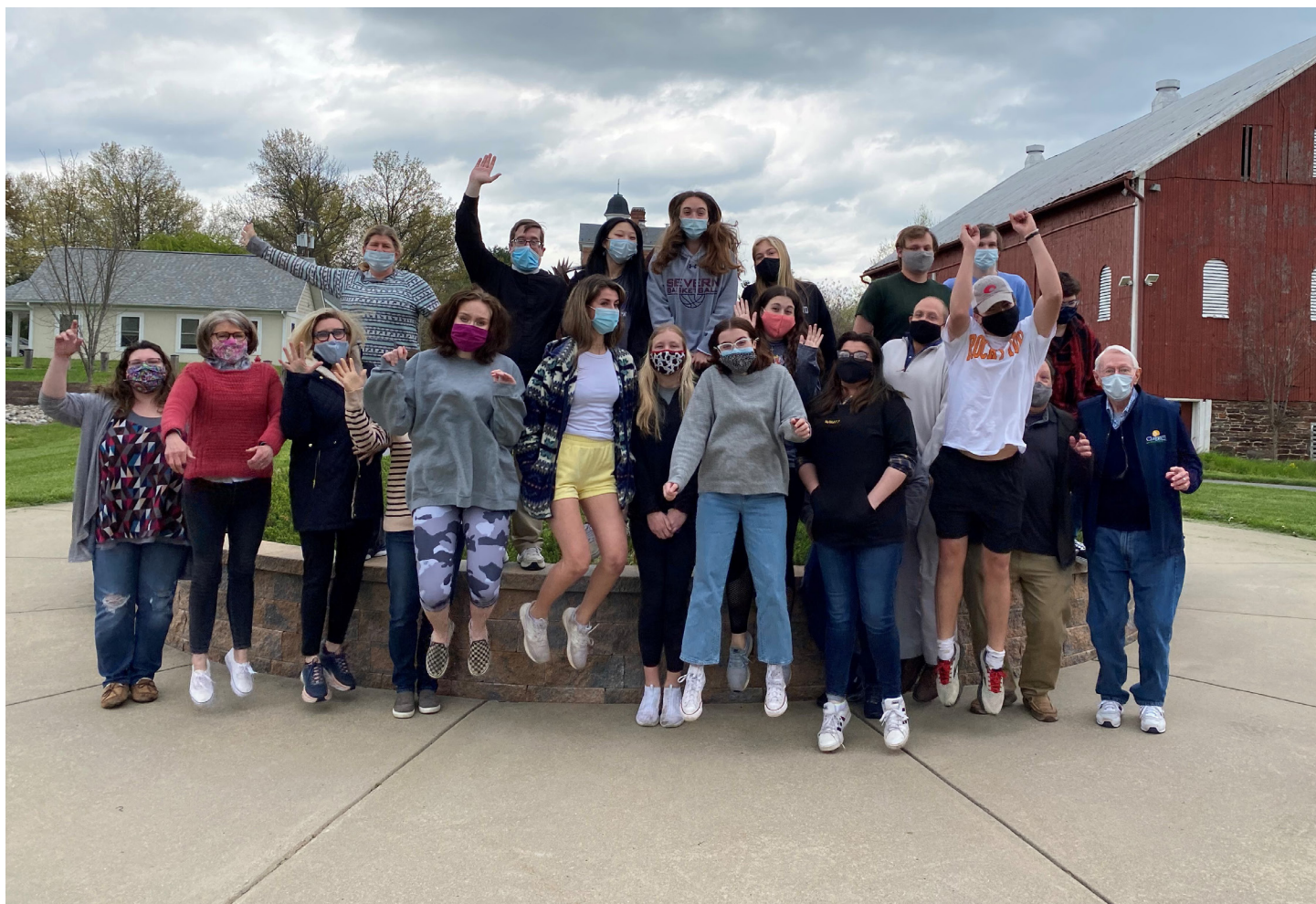
Claggett Confirmation Fun.