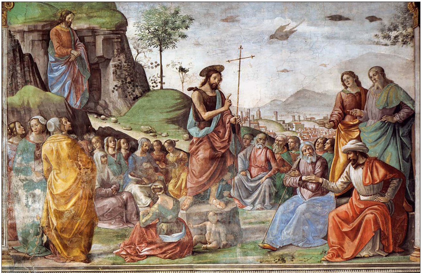
The Preaching of The Baptist by Domenico Ghirlandaio. Fresco, 1486-1490; Santa Maria Novella. Florence, Italy.