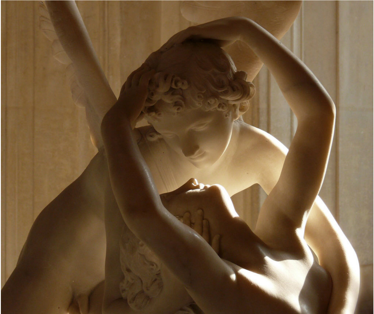
Psyche Revived by Cupid's Kiss , by Antonio Canova. Sculpture, marble; 1797. The Louvre Museum, Paris, France.