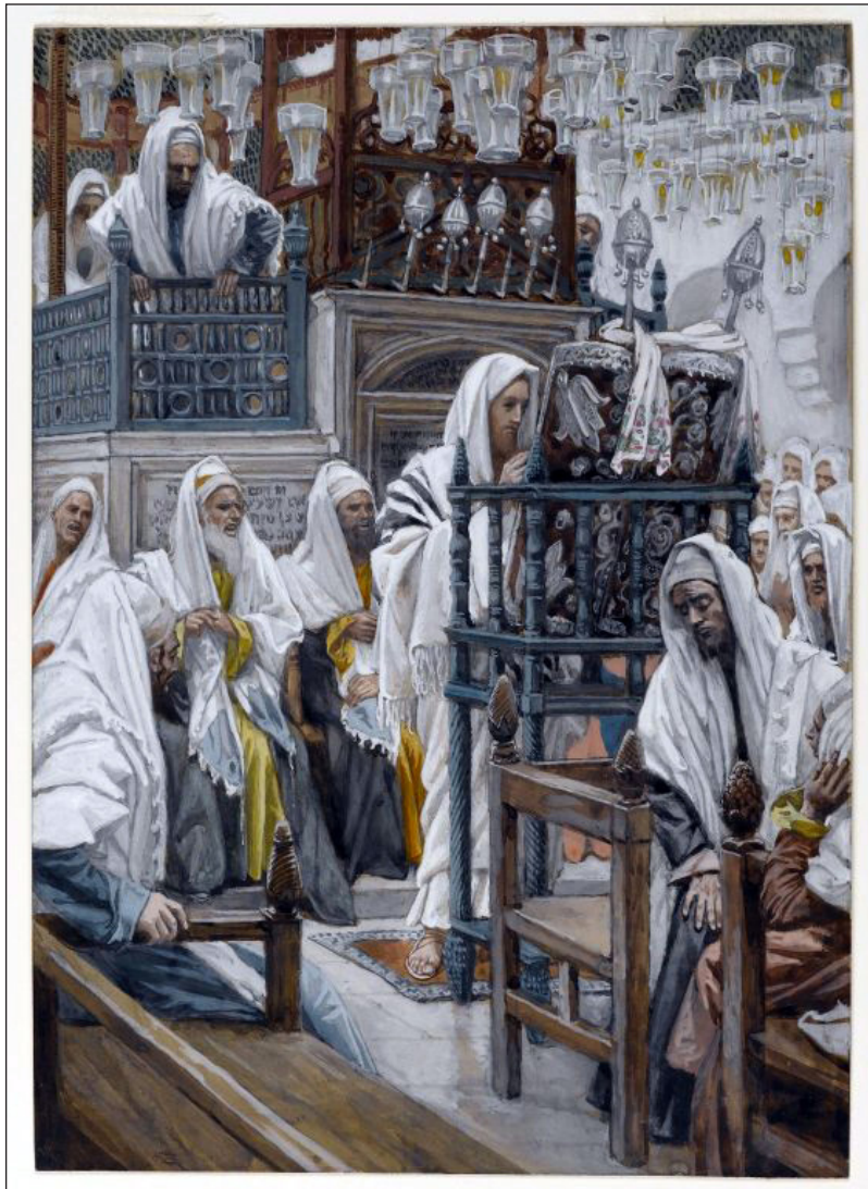
Jesus Unrolls the Book in the Synagogue by James Tissot, 1836-1902.