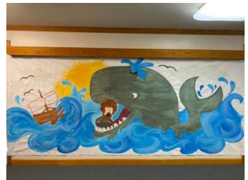
Above: Our Jonah and the Whale mural, painted by our talented Decorations Committee.