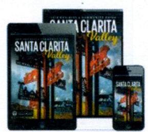
TABLET & SMARTPHONES

Don't miss this opportunity to tell your story!