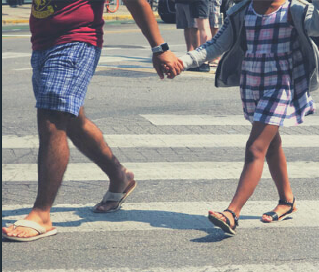
PHOTO: TOWARD A SHARED UNDERSTANDING OF PEDESTRIAN SAFETY; USDOT, JUNE 2020