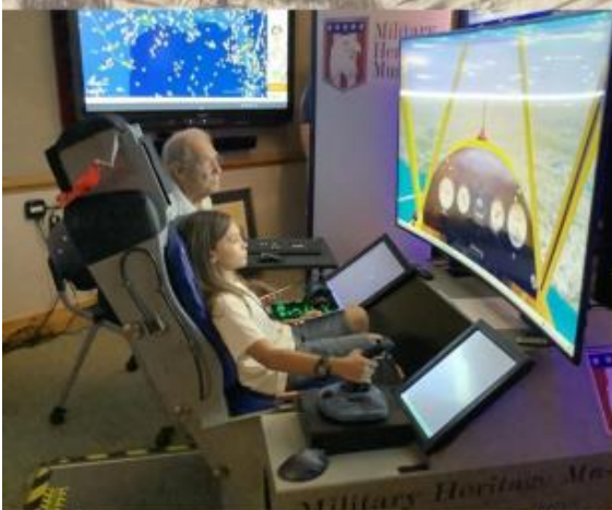
Flight simulators are one of the interactive activities included.

Dropoff after 8:00 AM and Pickup before 4:00 PM