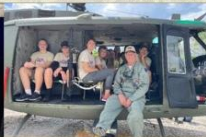
Camper experience Huey Helicopter cockpit to and other hands-on activities!

Cost is $195 per 5-day Day Camps Cost is $160 for 4-day Day Camp (7/5-7/8) Maximum 24 Participants per week Grades Entering 4th-9th in the Fall, 2022