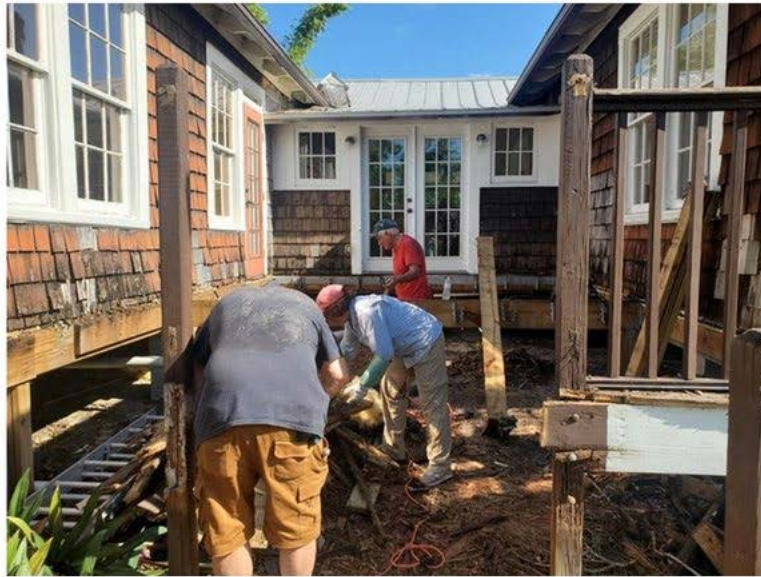
Tear Out and Structural Start of the Price House Middle Deck