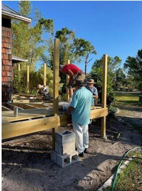
Replacement of Price House L-Shaped Side / Back Deck