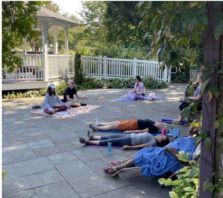
Participants of the Meditation in the Gardens program

11 - 11:55 a.m. (13-Adult) 8 sessions. $113 per person. Code 156.8VT3