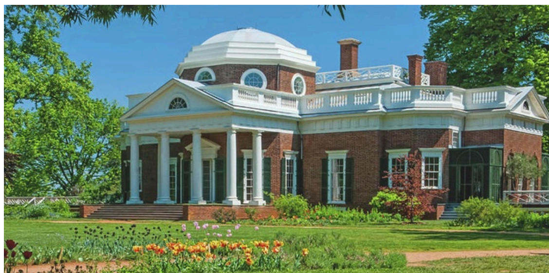
Thomas Jefferson's Monticello