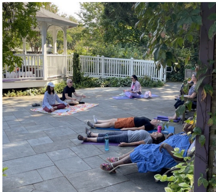
Participants of the Meditation in the Gardens program

Register at www.fairfaxcounty.gov/parks/parktakes using the program code or by calling 703-642-5173.