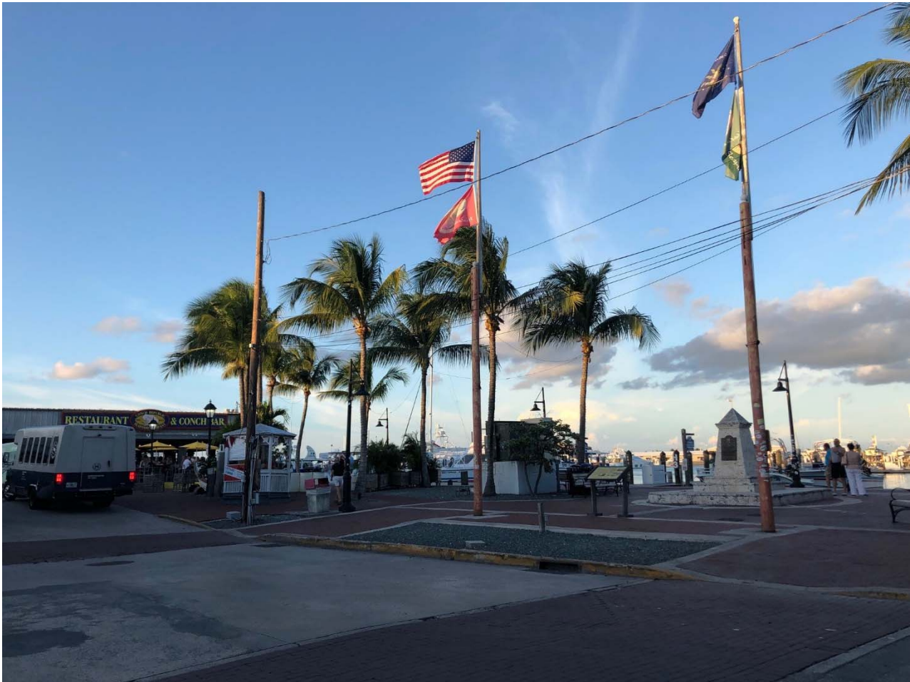
SITE A: Main entrance into the Key West Historic Seaport – corner of Greene and Elizabeth Streets

The Key West Bight Board (advisory board for the Seaport) requests the following possible elements: