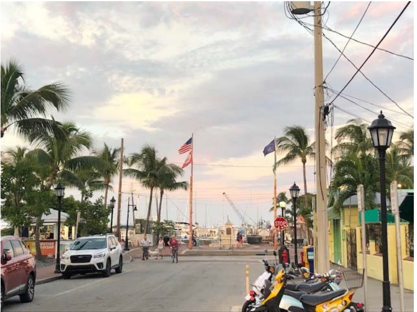
Half block view of main entrance at Greene Street, Key West