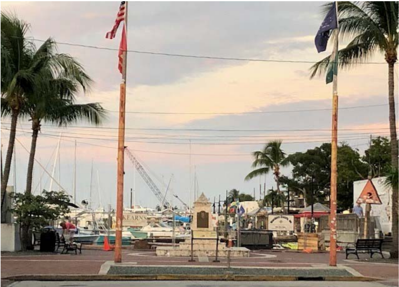
Close Up of main entrance at Greene Street, Key West

Please note: All proposed exterior artwork may not impact exiting trees, palms, shrubs or groundcover, and/or Sidewalk Access.