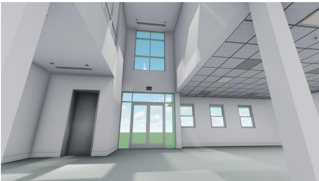
Architect rendering: Synalovski, Romanik, Saye Architects