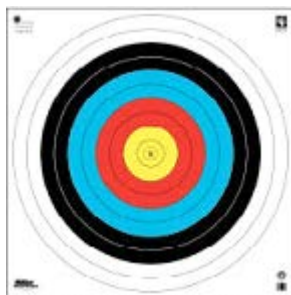
60 cm used in unsighted & sighted divisions