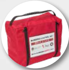
PORTABLE BLEEDING CONTROL BAG