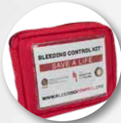
PREMIUM PERSONAL BLEEDING CONTROL KIT