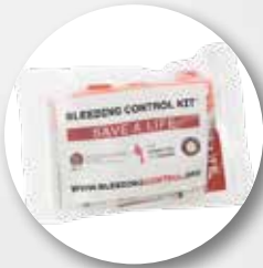
PERSONAL BLEEDING CONTROL KIT