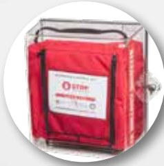
WALL-MOUNTED BLEEDING CONTROL STATION