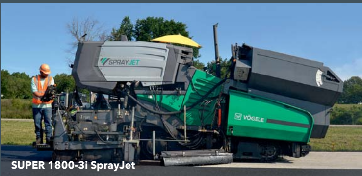
SUPER 1800-3i SprayJet

Wirtgen America, Inc. 6030 Dana Way · Antioch, TN 37013, USA Phone: (615) 501-0600 · Fax: (615) 501-0691 Internet: www.wirtgen-group.com/america