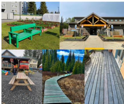
Grizzly Wood Applications