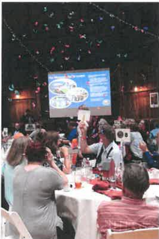
Live Auction after dinner