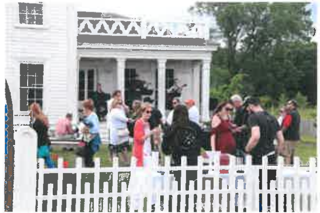
Guests enjoying Cocktail Hour