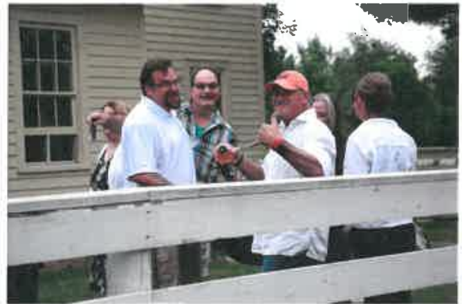
Having fun during Cocktail Hour