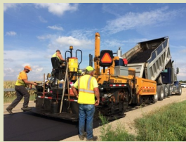
Paving between Sitler road & County campus