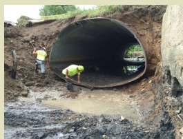
Preparing for culvert extension—Como Creek

Paving is underway and we have adjusted the plan to complete the area between Sitler Road and the County Campus first, as this is one of the heaviest traveled parts of the project. Once the paving is completed, the gravel shoulders, pavement markings and new signs will be installed by Walworth County Public Works.