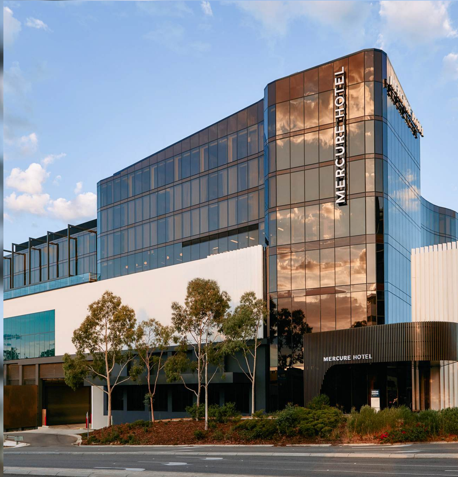
Image: Mercure Melbourne Doncaster Exterior