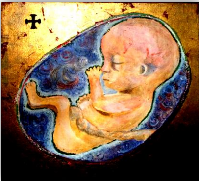
Icon of Unborn Jesus

LifeLines is published by Life Associates, Edmonton, AB. Contact: lifeassociatesedmonton@gmail.com