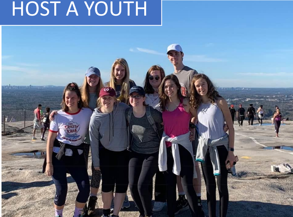
Photo of Australian Youth Exchange Students and their Atlanta host “siblings” at Stone Mountain