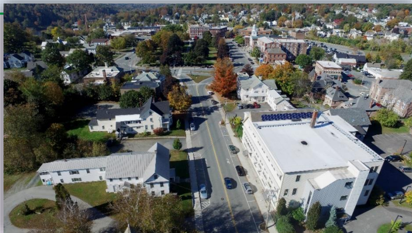
Lebanon, NH

All of these challenges and unknowns offer opportunities. To face difficulty and change with hope and creativity. Our economy, natural environment and culture depend in part on us planning effectively and then turning those plans into action. We learn a lot from actions taken nearby and faraway. Keys to the Valley will add to these conversations by highlighting new housing models, regulatory options, infrastructure considerations, and landscape. Despite the different approaches that are and will be taken, one thing will be the same - each community will take actions to ensure we have adequate homes.