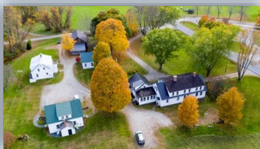
Pomfret, VT

The Upper Valley Continuum of Care is working on a strategic plan. Please help us distribute these surveys to address housing insecurity in our region . Surveys close Friday Oct 2 nd .