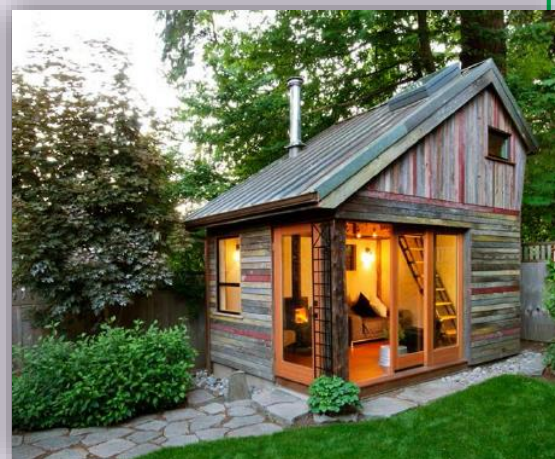
An example accessory dwelling unit.

The need for new homes at a reasonable price is clearly understood. However, they are generally not being produced by the market. It may be possible to provide new homes incrementally, especially in village locations that are served by infrastructure. Many people think there is "no room" for new homes in these areas. We developed a few mock developments to demonstrate and visualize what appears to be feasible. One such idea was done along Church Street in the Village of Chester, Vermont to help visualize how 7 new homes could fit within an existing neighborhood. See if you can identify the 2 mock buildings in the image below – one a duplex with 3 bedrooms for each unit and the other a smaller building to hold two detached rental units. Further down the street, there are locations imagined for accessory dwelling units as a low cost rental opportunities and the conversion of a large single family home to a duplex. Interacting visually with an imagined future can help us consider possibilities more clearly and make better decisions.