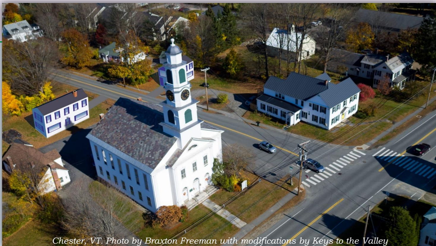
Chester, VT.