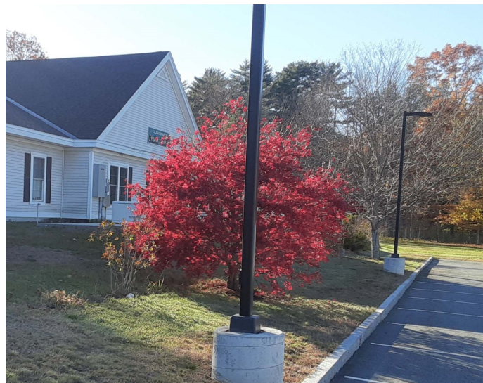
Firebush at the Center. Showing it's fall colors.

Face book postings, management, Articles for the newsletter, not just ideas Newspaper and newsletter articles Decorating Cleaning windows Reception desk Help out with Kitchen and meals