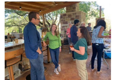
Right: SWAT Club members socializing at live event