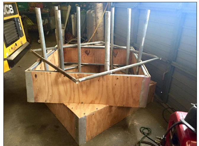
The fourth sculpture (above, left) was submitted by a SUNY New Paltz student and is being welded by New Paltz staff using material recovered from the scrap metal pile and deposit cans (above, right). This is “Education.”