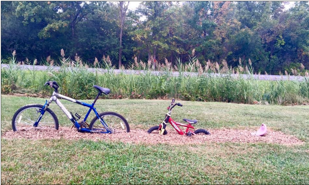
The third sculpture (left) was dreamed (literally) by a member of the New Paltz staff and was created for “Re-Cycling.”