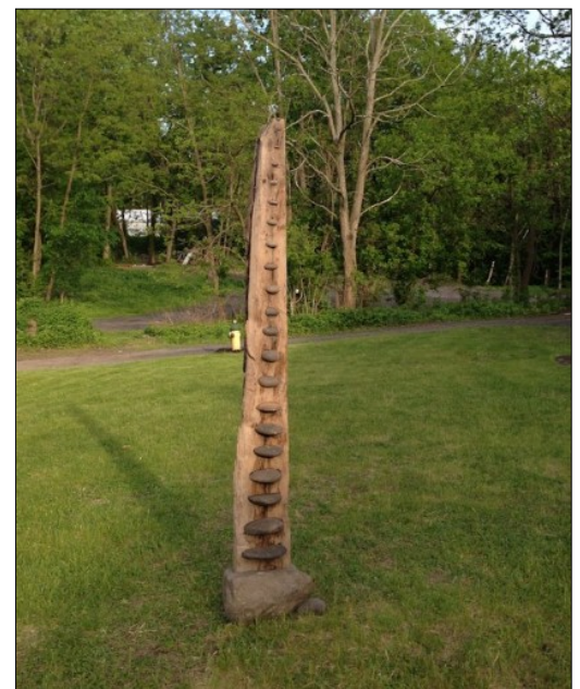
The fifth and final sculpture was submitted by a local artist, using items found on the New Paltz Clearwater property. This piece will be titled “Environment.”