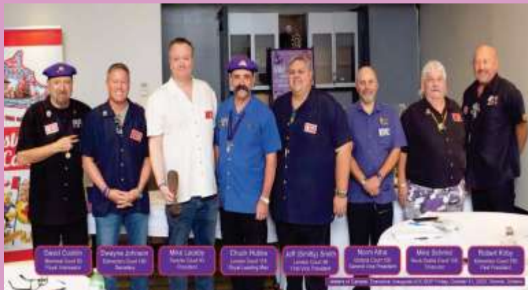
Calgary Court

The second event sponsored by Jesters of Canada If you missed Toronto, don't miss this one!