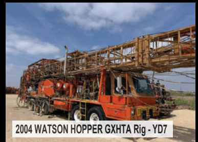
2004 WATSON HOPPER GXHTA Rig - YD7