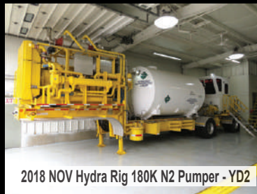
2018 NOV Hydra Rig 180K N2 Pumper - YD2