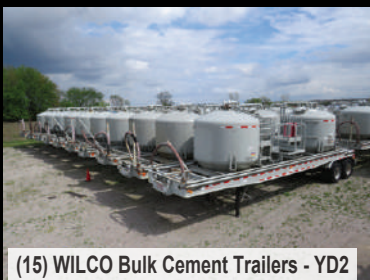
(15) WILCO Bulk Cement Trailers - YD2

SCAN THE QR CODE TO VIEW EQUIPMENT YARD LOCATIONS AND BIDDING TERMS