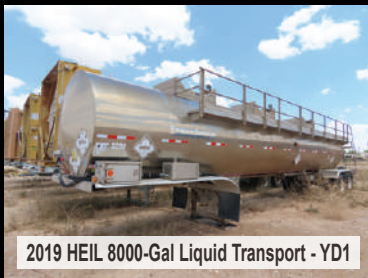
2019 HEIL 8000-Gal Liquid Transport - YD1