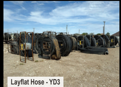
Layflat Hose - YD3