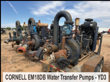
CORNELL EM18DB Water Transfer Pumps - YD3

PRESORTED FIRST CLASS MAIL US POSTAGE PAID PERMIT NO 244 SAN ANTONIO TX