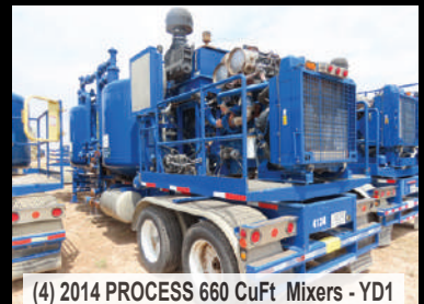
(4) 2014 PROCESS 660 CuFt Mixers - YD1