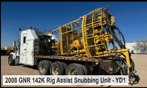
2008 GNR 142K Rig Assist Snubbing Unit - YD1