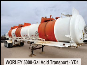
WORLEY 5000-Gal Acid Transport - YD1