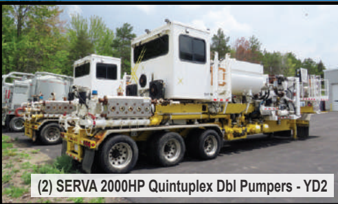
(2) SERVA 2000HP Quintuplex Dbl Pumps - YD2