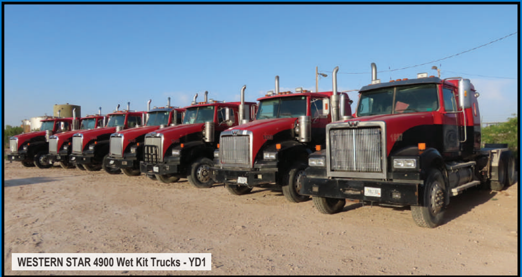
WESTERN STAR 4900 Wet Kit Trucks - YD1

FEATURING WET-KIT TRUCKS DOUBLE PUMPERS • CEMENT TRAILERS SNUBBING UNITS • COIL TUBING FRAC TRAILERS & COMPONENTS WELL SERVICE & DRILLING RIGS WATER TRANSFER EQUIPMENT