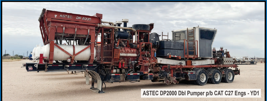
ASTEC DP2000 Dbl Pumper p/b CAT C27 Engs - YD1

FEATURING WET-KIT TRUCKS DOUBLE PUMPERS • CEMENT TRAILERS SNUBBING UNITS • COIL TUBING FRAC TRAILERS & COMPONENTS WELL SERVICE & DRILLING RIGS WATER TRANSFER EQUIPMENT