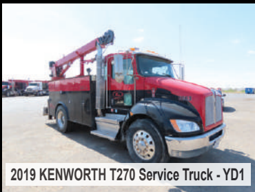
2019 KENWORTH T270 Service Truck - YD1