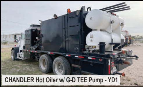
CHANDLER Hot Oiler w/ G-D TEE Pump - YD1