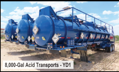
8,000-Gal Acid Transports - YD1