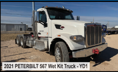
2021 PETERBILT 567 Wet Kit Truck - YD1