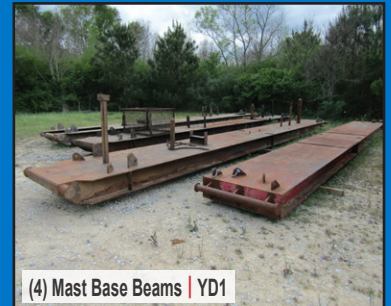
(4) Mast Base Beams | YD1