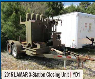
2015 LAMAR 3-Station Closing Unit | YD1