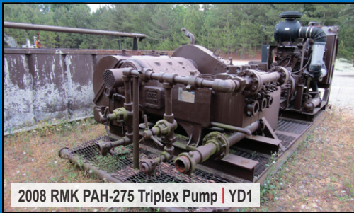
2008 RMK PAH-275 Triplex Pump | YD1