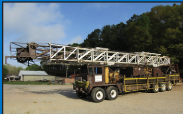
1979 COOPER LTO-350 Well Service Rig | YD1