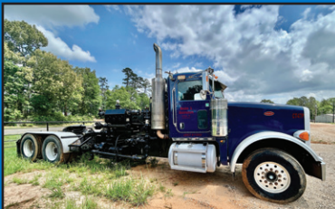
PETERBILT Kill Truck w/ G-D 600HP Triplex | YD2