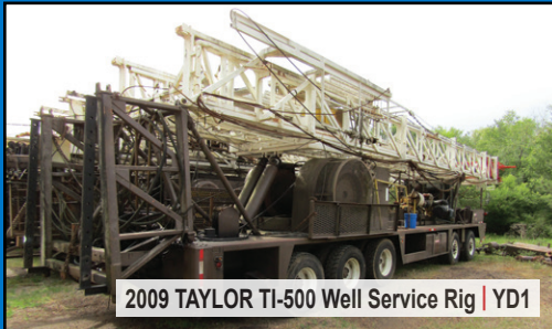
2009 TAYLOR TI-500 Well Service Rig | YD1