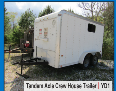
Tandem Axle Crew House Trailer | YD1