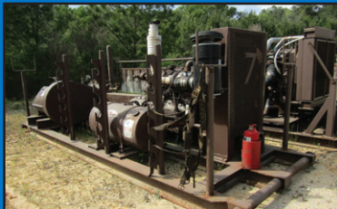
(2) GASO 3676 Triplex Pumps | YD1