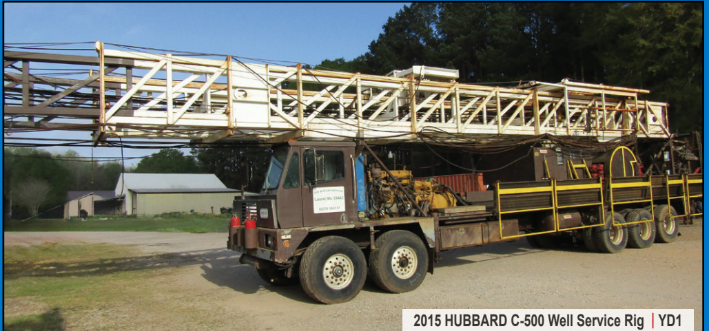
2015 HUBBARD C-500 Well Service Rig | YD1

COMPLETE LIQUIDATION OF LEE & LEE SERVICES After 44 Years in Business, They Are Selling Their Well-Maintained One Owner Rigs