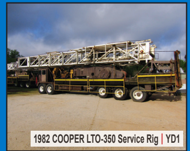
1982 COOPER LTO-350 Service Rig | YD1