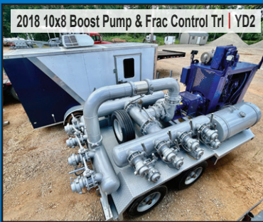
2018 10x8 Boost Pump & Frac Control Trl | YD2

SCAN THE QR CODE TO VIEW EQUIPMENT, YARD LOCATIONS AND BIDDING TERMS