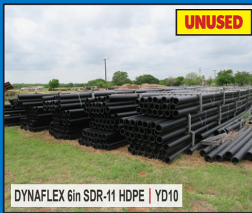
DYNAFLEX 6in SDR-11 HDPE | YD10