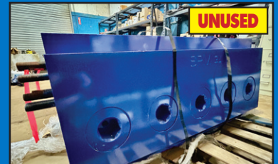
(5) SPM and KERR Fluid Ends | YD2

AUCTION MAY 20, 2026 9:00 AM (CT) BOSSIER CITY, LA