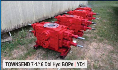
TOWNSEND 7-1/16 Dbl Hyd BOPs | YD1