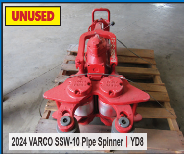
2024 VARCO SSW-10 Pipe Spinner | YD8