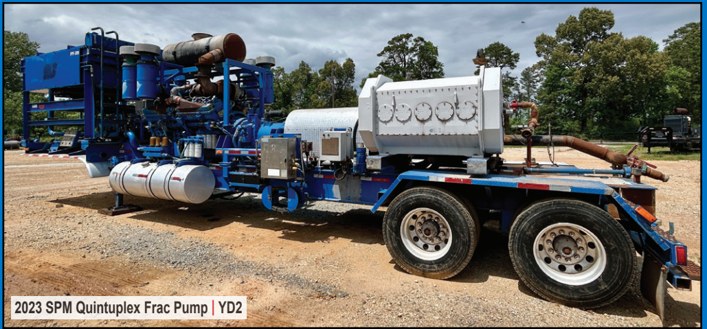
2023 SPM Quintuplex Frac Pump | YD2

(6) WELL SERVICE RIGS • TRIPLEX REVERSE PUMPS BOPS • TUBING TONGS • WELL SERVICE TOOLS 2023 & 2019 QUINTUPLEX FRAC PUMPS & RELATED DRILLING COMPONENTS • UNUSED HDPE