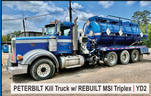
PETERBILT Kill Truck w/ REBUILT MSI Triplex | YD2