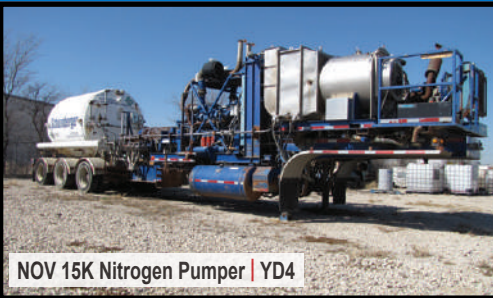
NOV 15K Nitrogen Pumper | YD4