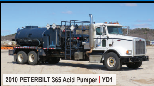
2010 PETERBILT 365 Acid Pumper | YD1