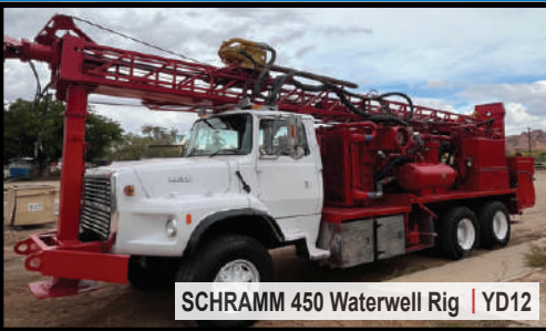
SCHRAMM 450 Waterwell Rig | YD12