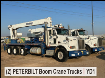
(2) PETERBILT Boom Crane Trucks | YD1