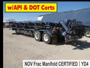
NOV Frac Manifold CERTIFIED | YD4