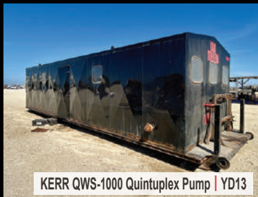
KERR QWS-1000 Quintuplex Pump | YD13