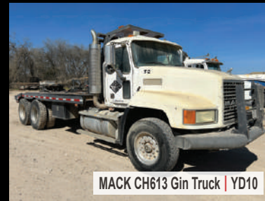
MACK CH613 Gin Truck | YD10