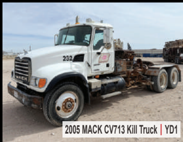
2005 MACK CV713 Kill Truck | YD1