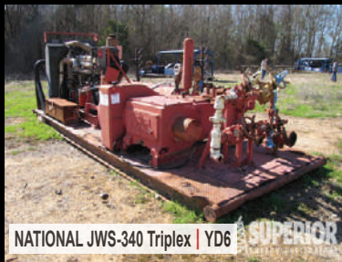
NATIONAL JWS-340 Triplex | YD6