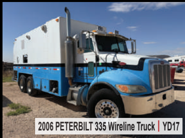
2006 PETERBILT 335 Wireline Truck | YD17