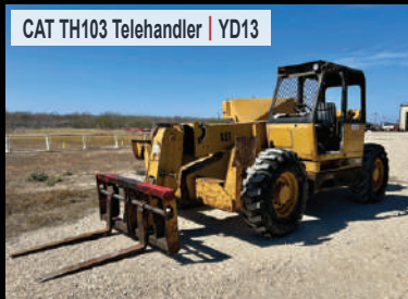
CAT TH103 Telehandler | YD13