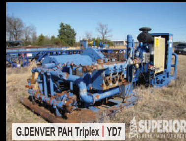
G.DENVER PAH Triplex | YD7