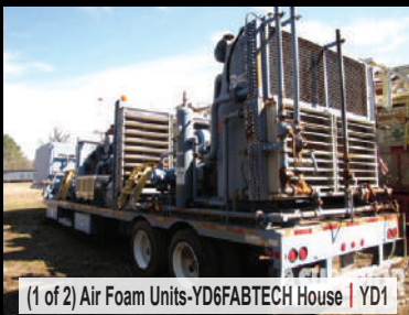
(1 of 2) Air Foam Units-YD6FABTECH House | YD1