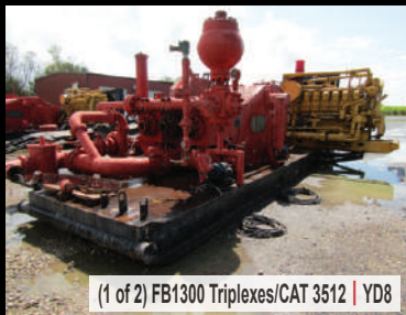
(1 of 2) FB1300 Triplexes/CAT 3512 | YD8