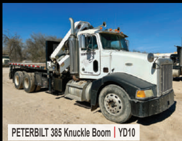
PETERBILT 385 Knuckle Boom | YD10