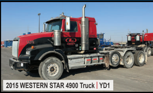
2015 WESTERN STAR 4900 Truck | YD1