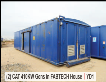
(2) CAT 410KW Gens in FABTECH House | YD1