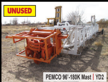
PEMCO 96'-180K Mast | YD2