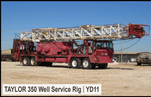
TAYLOR 350 Well Service Rig | YD11