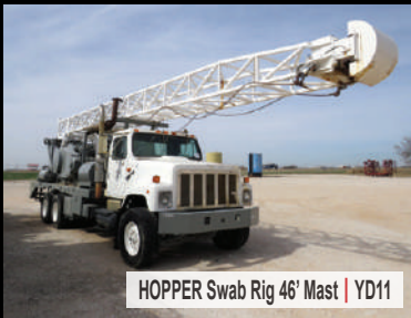
HOPPER Swab Rig 46' Mast | YD11