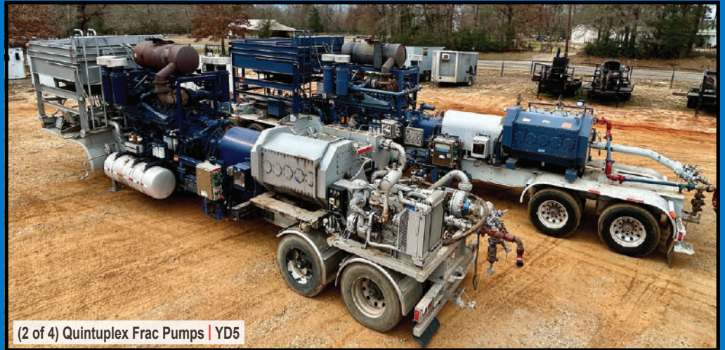
(2 of 4) Quintuplex Frac Pumps | YD5

FRAC PUMPS • NITROGEN PUMPER WELL SERVICE & WATERWELL RIGS QUINTUPLEX & TRIPLEX PUMPS • CONSTRUCTION DRILLING COMPONENTS • TRUCKS/TRAILERS