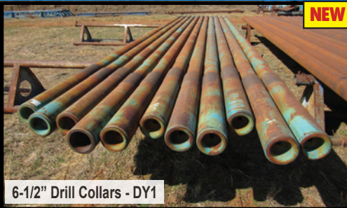
6-1/2" Drill Collars - DY1