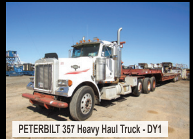
PETERBILT 357 Heavy Haul Truck - DY1