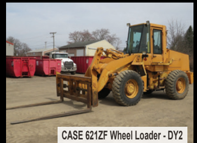
CASE 621ZF Wheel Loader - DY2