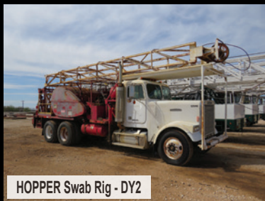
HOPPER Swab Rig - DY2