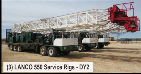
(3) LANCO 550 Service Rigs - DY2