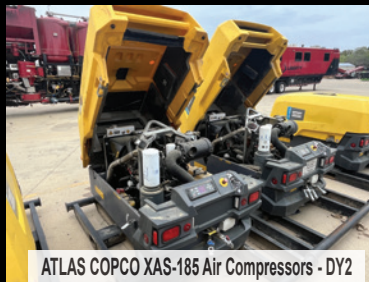
ATLAS COPCO XAS-185 Air Compressors - DY2