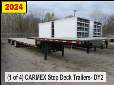
(1 of 4) CARMEX Step Deck Trailers - DY2