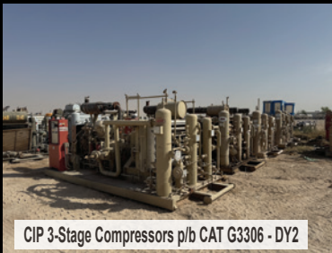
CIP 3-Stage Compressors p/b CAT G3306 - DY2