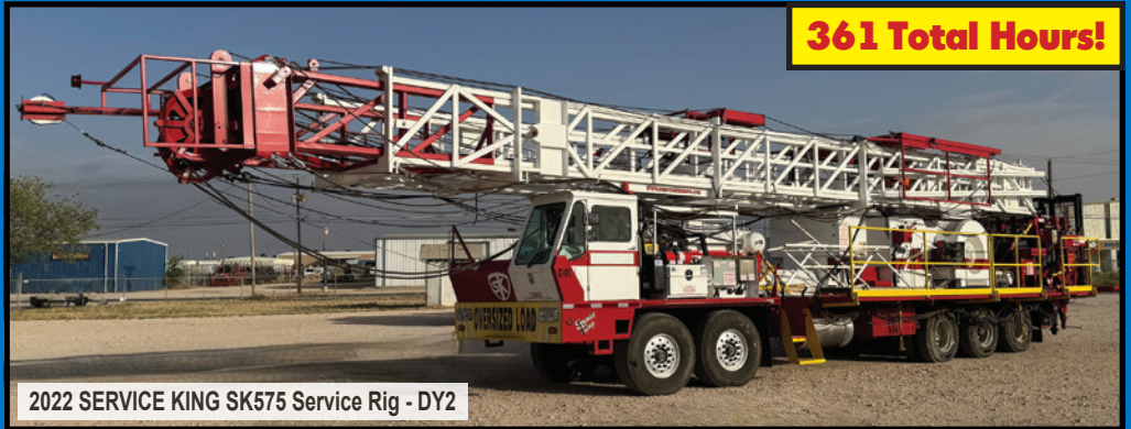
2022 SERVICE KING SK575 Service Rig - DY2