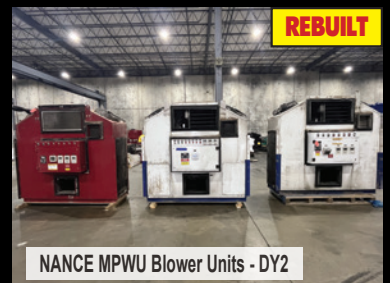
NANCE MPWU Blower Units - DY2