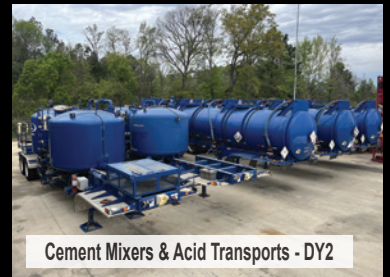
Cement Mixers & Acid Transports - DY2