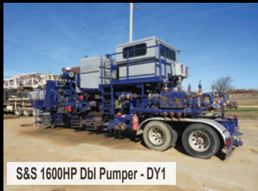
S&S 1600HP Dbl Pumper - DY1