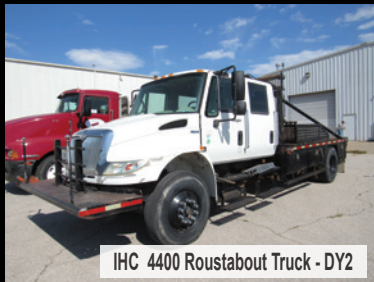
IHC 4400 Roustabout Truck - DY2

PRESORTED FIRST CLASS MAIL US POSTAGE PAID PERMIT NO 244 SAN ANTONIO TX