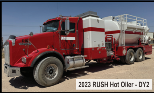
2023 RUSH Hot Oiler - DY2