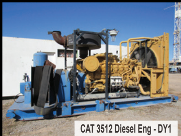
CAT 3512 Diesel Eng - DY1