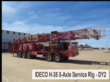
IDECO H-35 5-Axle Service Rig - DY2