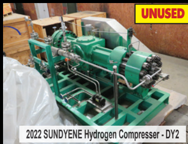
2022 SUNDYENE Hydrogen Compressor - DY2