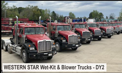
WESTERN STAR Wet-Kit & Blower Trucks - DY2

9:00 A.M. (CT) EACH DAY @ EMBASSY SUITES - AIRPORT