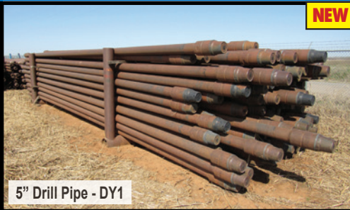
5" Drill Pipe - DY1