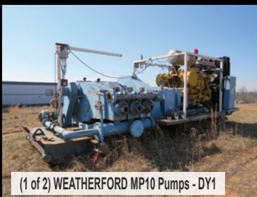
(1 of 2) WEATHERFORD MP10 Pumps - DY1