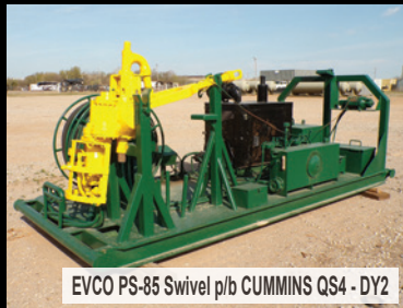
EVCO PS-85 Swivel p/b CUMMINS QS4 - DY2