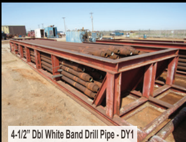
4-1/2" Dbl White Band Drill Pipe - DY1