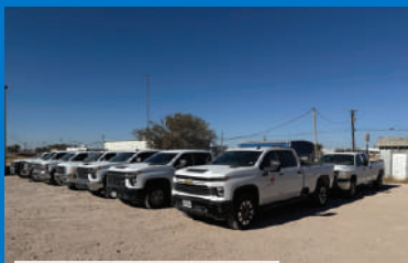
(22) 2024-2014 Pickups