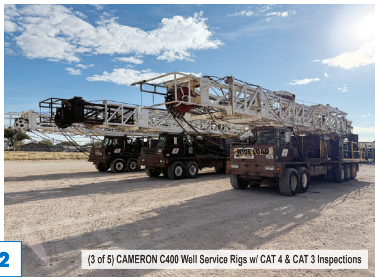
(3 of 5) CAMERON C400 Well Service Rigs w/ CAT 4 & CAT 3 Inspections

1982 WILSON 42B Well Service Rig, Disc Assist Brakes, p/b DETROIT Series 60 Eng, ALLISON 5610 Trans, WILSON 96'H x 180,000# Mast, On 5-Axle Carrier, Adj Work Platform, 385/65R22.5 Front & 11R22.5 Rear Tires • 100 Ton Block