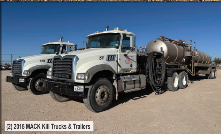
(2) 2015 MACK Kill Trucks & Trailers

(18) SERVICE KING SK575, CAMERON C400, & WILSON 42B WELL SERVICE RIGS • (4) MACK KILL TRUCKS (2) LOGAN VTS-100 POWER SWIVELS • (4) 130-BBL KILL TRAILERS • (1) VACUUM TRUCK (1) 130-BBL VACUUM TRAILER • (22) CHEVY, GMC & FORD PICKUPS • (16) DOGHOUSE TRAILERS