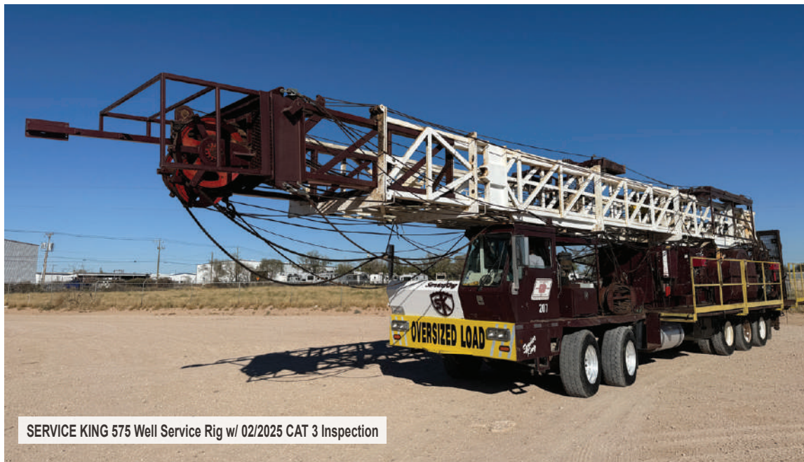
SERVICE KING 575 Well Service Rig w/ 02/2025 CAT 3 Inspection