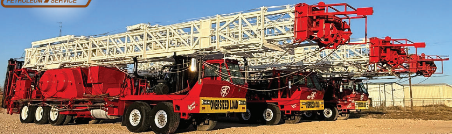
(3 of 5) SERVICE KING 575 Well Service Rigs w/ CAT 4 & CAT 3 Inspections

WEDNESDAY • JANUARY 21, 2026 • ODESSA, TEXAS