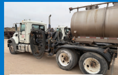
2015 MACK Kill Truck w/ G-D TEE