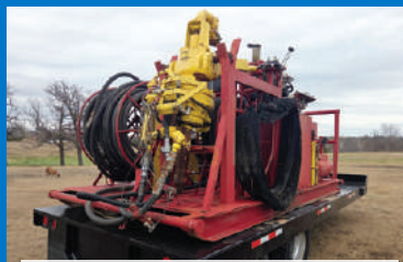
(1 of 2) LOGAN VTS-100 10K Power Swivels