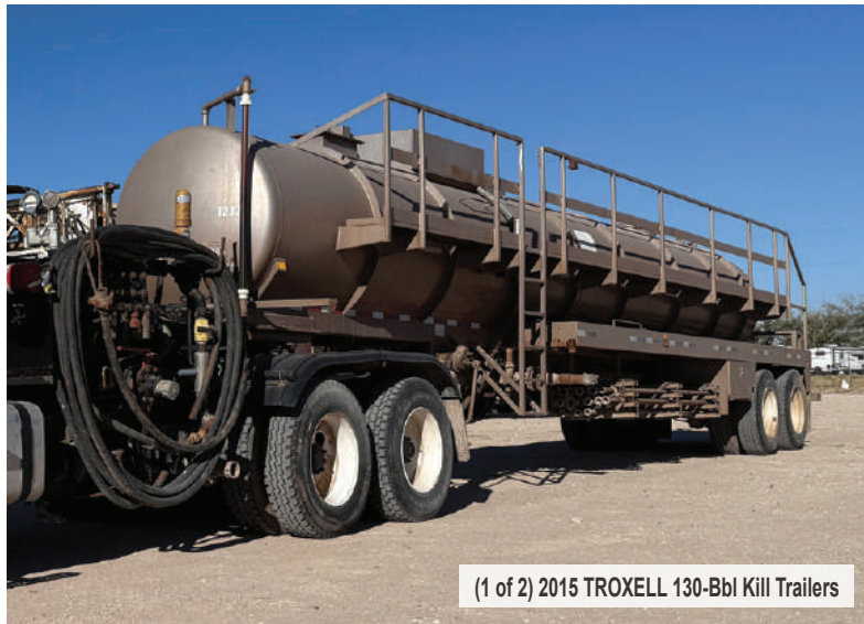
(1 of 2) 2015 TROXELL 130-Bbl Kill Trailers