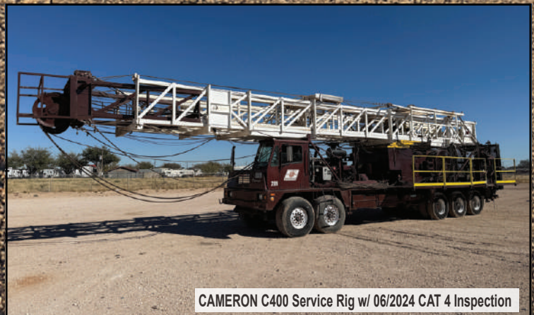
CAMERON C400 Service Rig w/ 06/2024 CAT 4 Inspection

FOR MORE INFO Call 432-296-4465 or Visit www.SuperiorAuctioneers.com