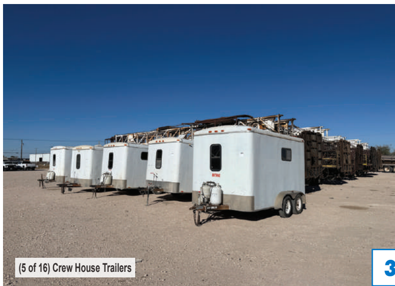
(5 of 16) Crew House Trailers