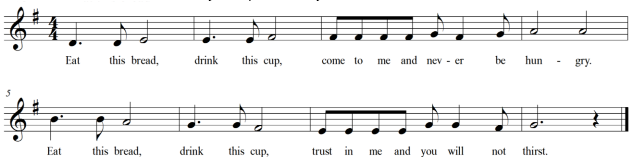
From The New Century Hymnal, Copyright © 1995 The Pilgrim Press. Permission is granted for this one-time use.

The Celebrant breaks the consecrated Bread. A period of silence is kept.