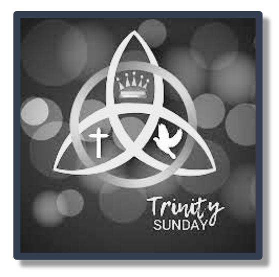
The Liturgy of the Word

May 26, 2024 10:30am Hybrid Service Meeting ID 715 310 766 Password 014954