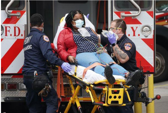
First Responders - Corona