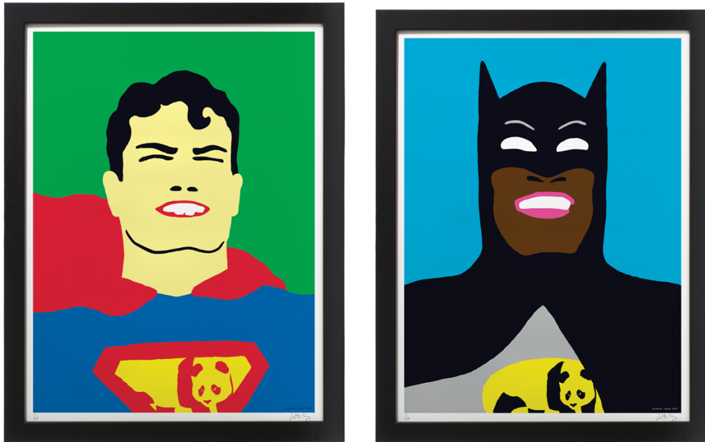
Winston Tseng, International Superhero series, 2009, giclée print on archival museum rag paper

6815 Cypresswood Drive • Spring, TX 77379 • 281.376.6322