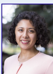
Judge Lina Hidalgo Harris County Judge (invited)