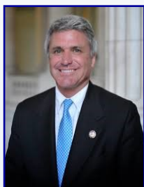
Congressman Michael McCaul District 10 (invited)