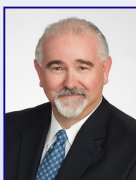
Pct 4 Commissioner R. Jack Cagle Harris County Precinct 4