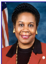
Congresswoman Sheila Jackson-Lee District 18 (invited)