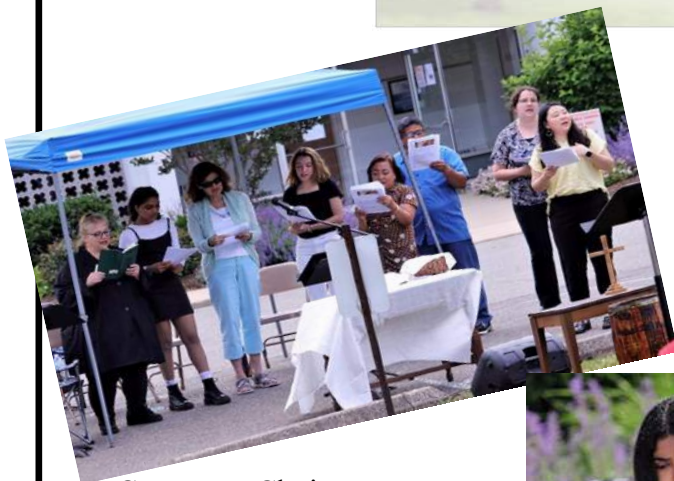
Centenary Choir sang "Here I Am to Worship, How Great Is Our God, Good, Good Father" and the audience joined in on the last song "The Stand."