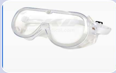
Model:Y1-A With aspirail