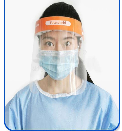
Face shield SKL-M1