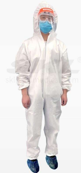
Isolation clothing SKL-C