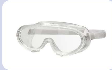
Model: Y1-B Without aspirail