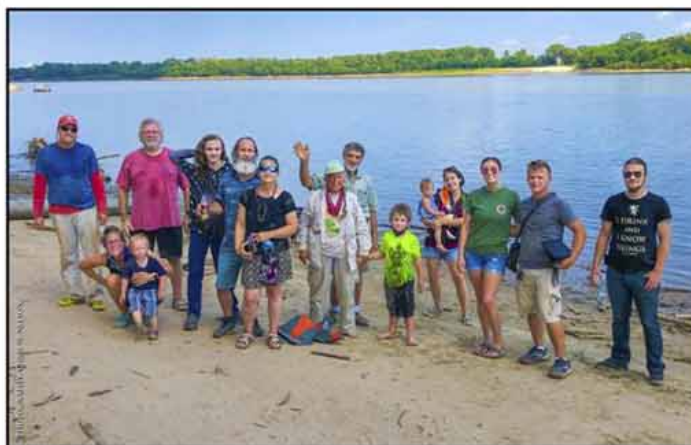
St. Louis, Missouri