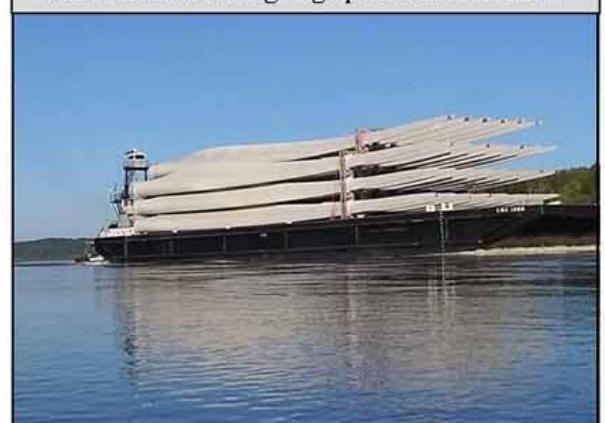
Wind turbine blades going up the Missouri River

The Missouri River was calm, relaxing, beautiful. Had one close call with a large barge turning and heading toward me in the middle of the River — missed by a couple feet. Interesting sights along the way — single white pelicans, barges filled with dozens of wind turbine blades heading up stream, tug boats pushing up to 5 flat boats/barges filled with large rocks to shore up the levees, hippies dancing along the river bank early Sunday morning near Kansas City, large fish dump pouring out of a confluence with small stream upstream from Miami (hit the news) ... But the most distracting and disheartening sight along the way was the amount of trash, tires, metal appliances and much more lining the banks along the way. Thus the inspiration for my next outdoor mission — Missouri River Relief!