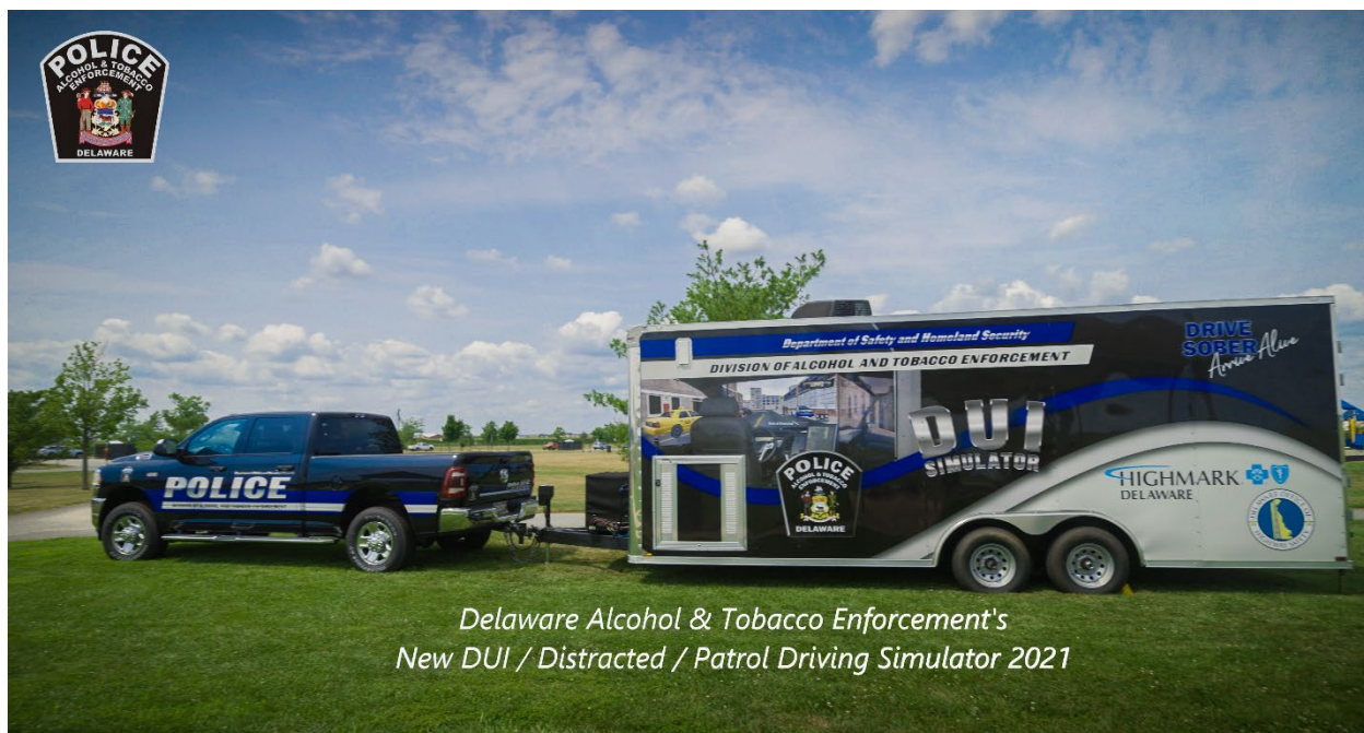
Delaware Alcohol & Tobacco Enforcement's New DUI / Distracted / Patrol Driving Simulator 2021