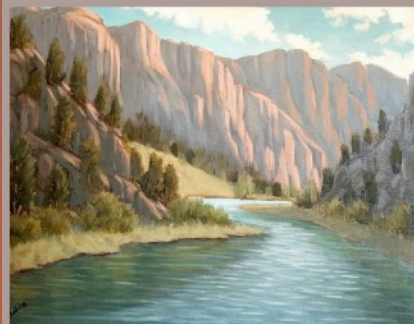
Colorado Rivers & Canyons GEORGE BODDE