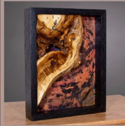
Maple Burl & Copper Clocks BRIAN BENHAM