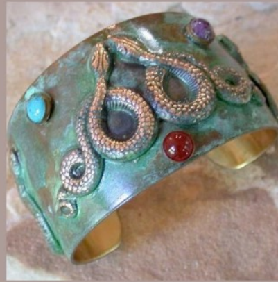
Brass & Copper Cuffs ELAINE COYNE