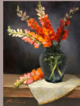
Still Life & Florals JUSTIN CLEMENTS