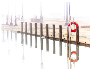
Foggy Morning by Richard McBride from Conneaut, OH

Many activities at or near a water body - like a stream, lake, or wetland - require a permit from the U.S. Army Corp of Engineers and Ohio EPA. Residents who plan to alter a wetland, modify a shoreline, build a dock or seawall, construct a ditch/culvert, or other similar activity should be aware of the restrictions and permit requirements associated with those activities BEFORE they begin. It's important that local leaders are familiar with these regulations as these are common questions that come up in community forums, board and planning meetings, and one-on-one conversations with residents. This webinar will provide an overview of the requirements associated with construction/modifications near or at a lake, stream, wetland, or other water body in Ohio and the opportunities for local protection.