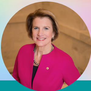
Shelley Moore Capito United States Senator