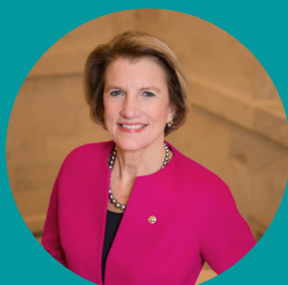
Shelley Moore Capito United States Senator