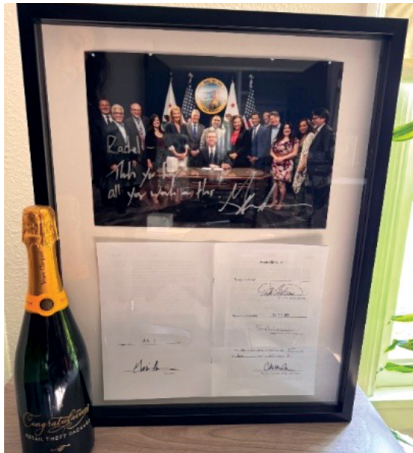
Governors thank you gift for CRA's work on PAGA and Retail Theft Package

Join the California Retail Grocery Coalition and gain collective strength, expertise, and advocacy grocery businesses need to thrive. Coalition membership equips grocers with resources, representation, and relationships that make a real impact on your bottom line and community.