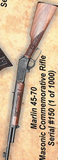
Marlin 45-70 Masonic Commemorative Rifle Serial #150 (1 of 1000)

Sesquicentennial Colins embedded in the backside of butt stock