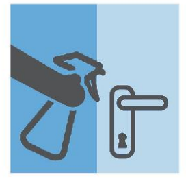
CLEAN AND DISINFECT "HIGH-TOUCH" SURFACES OFTEN