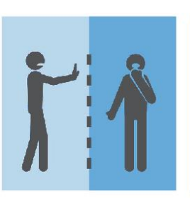
AVOID CONTACT WITH PEOPLE WHO ARE SICK